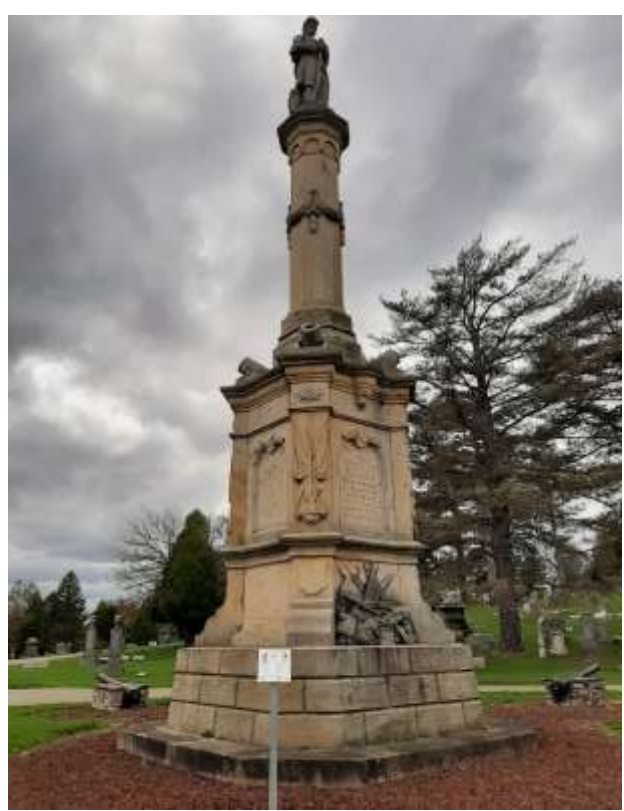
A Revolutionary War veterans sign has been placed in the Washington Cemetery at the veterans monument.