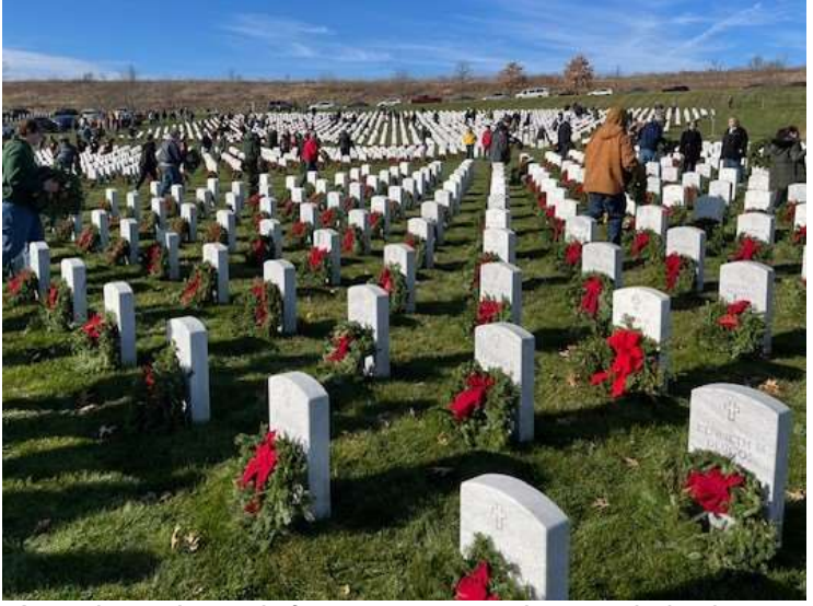
An estimated crowd of 2,000 to 3,000 volunteers help place wreaths at the National Cemetery of the Alleghenies on Saturday December 16, 2023.