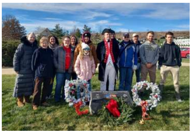
Members of the C.A.R., DAR and SAR joined in a brief ceremony at our George Washington "boulder".